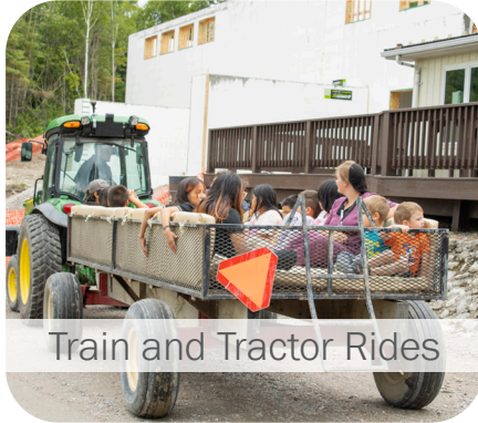
Train and Tractor Rides